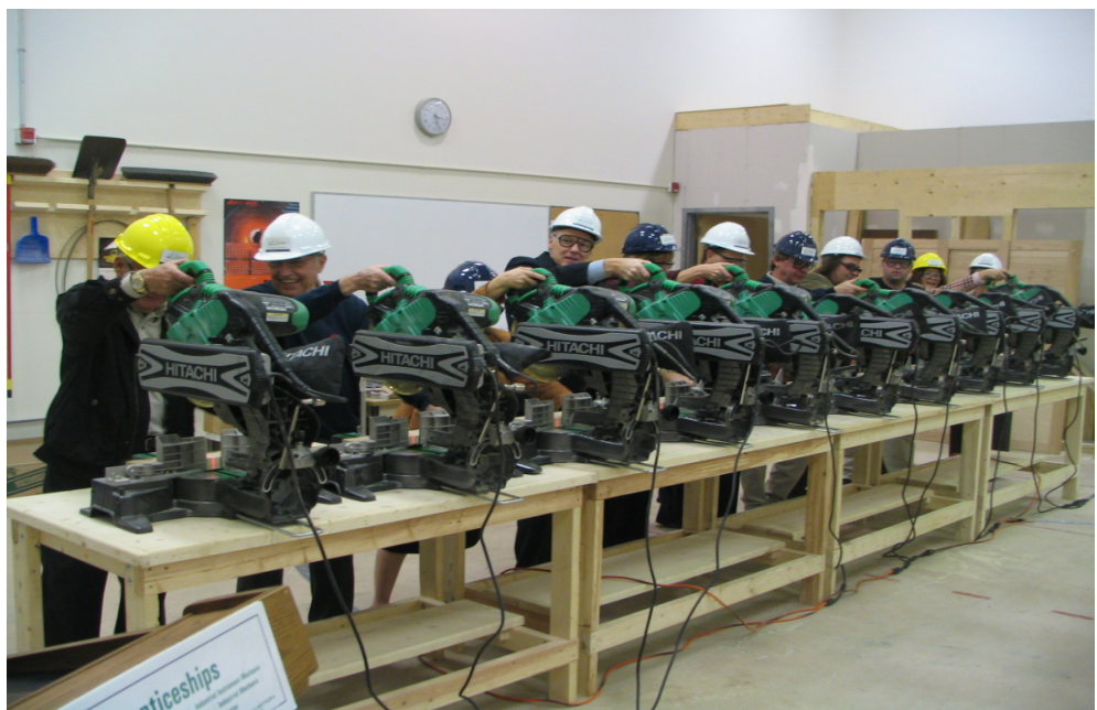
Skilled Trades Training Centre "Ribbon Cutting"